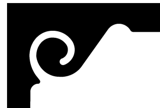
7029 SCROLLED TREAD BRACKET 3/8" thick x 11-9/16" w. x 7-5/16" h.