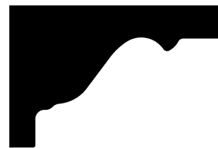
7028 CLASSIC TREAD BRACKET 3/8" thick x 11-9/16" w. x 7-5/16" h.