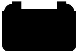
6840 2-5/8" wide x 5/8" high Plow 1-1/4" w. x 1/4" d.