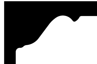
7028 CLASSIC TREAD BRACKET 3/8" thick x 11-9/16" w. x 7-5/16" h.